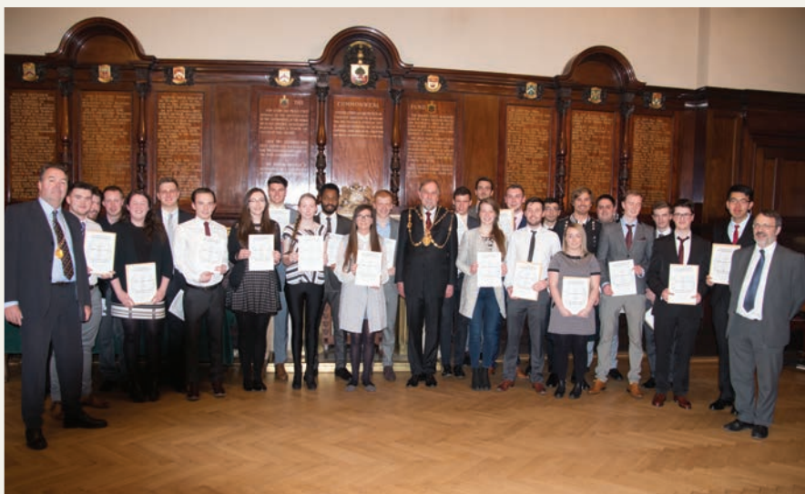
Hammermen Award Winners 2016