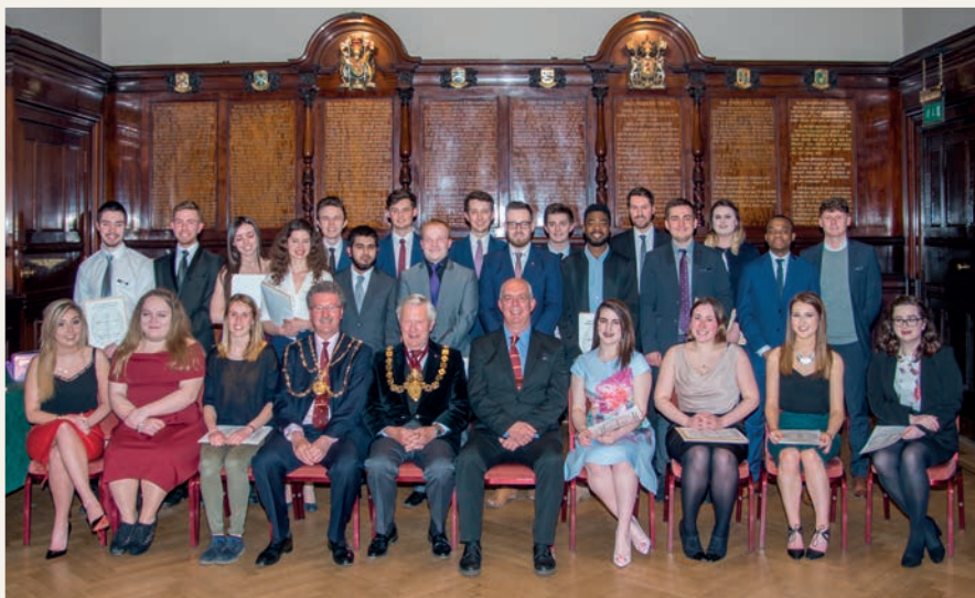
Hammermen Award Winners 2017