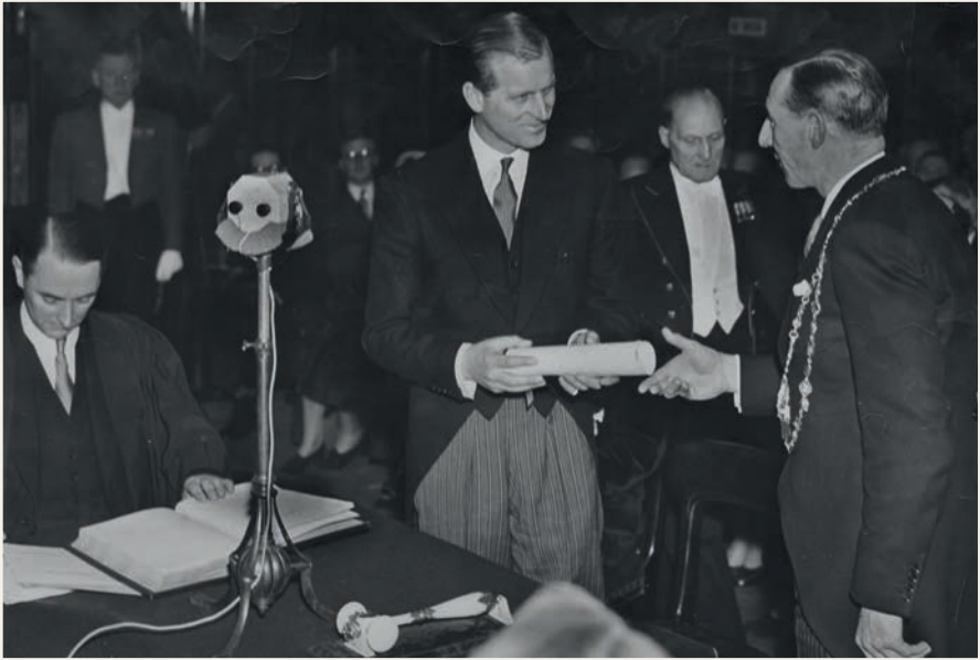
HRH The Duke of Edinburgh receiving his Certificate of Honorary Membership of the Incorporation of Hammermen of Glasgow. Trades House, 1955