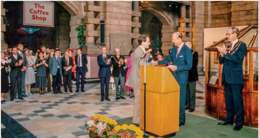
HRH The Duke of Edinburgh presenting a Prize at the Hammermen's 450th Anniversary Celebrations Kelvingrove Art Gallery and Museum, 1987