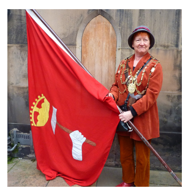
The Deacon at the Lyon's Court celebration

In December, I carried the Hammermen's flag in the Trades House group attending the Lyon Court's celebration of 350 years of its registry of coats of arms, at St Giles Cathedral. I also took our flag to the Stirling 'Walking the Marches' in support of the Hammermen there.