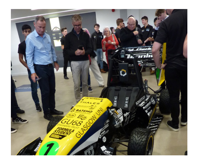
Launch event for the latest car