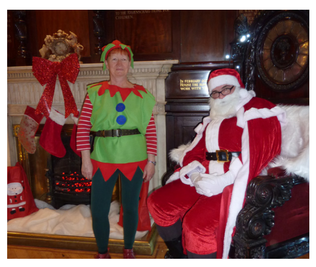
The Deacon with Santa, aka Deacon of the Cordiners

Other events have included schools visits, 'Elving' at the Trades House Christmas fair and attending lunches for our elderly beneficiaries.